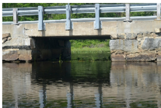
Mosquito Bridge from Snake River

The name Windy Waters Conservancy™ (WVC) is the Business name of the Waukewan Shore Owners Association, a tax exempt charitable organization within the meaning of Section 501(c)(3) of the Internal Revenue Code.