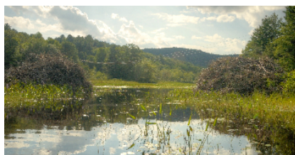
Snake River looking toward Waukewan from above the beaver dam

The Shoreland Water Quality Protection Act ("the Act") provides standards for development on the lakes and ponds in the Waukewan watershed. This Act applies to all state waters known as Great Ponds (10 or more acres in surface area) and "Designated Rivers." A Designated River is either one that was on the initial list when the law was enacted or one that is a fourth order stream or higher (a technical measure based on the number of tributaries entering the main stem).