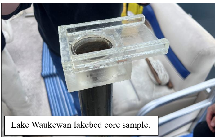
Lake Waukewan lakebed core sample.